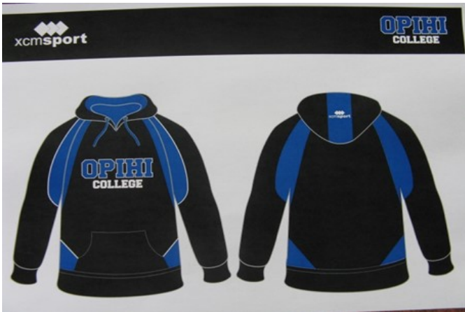
OPIHI COLLEGE HOODIES FOR SALE $50

The winter uniform will become compulsory after the Queens Birthday holiday weekend. During May, students may choose to wear the summer or the winter uniform.