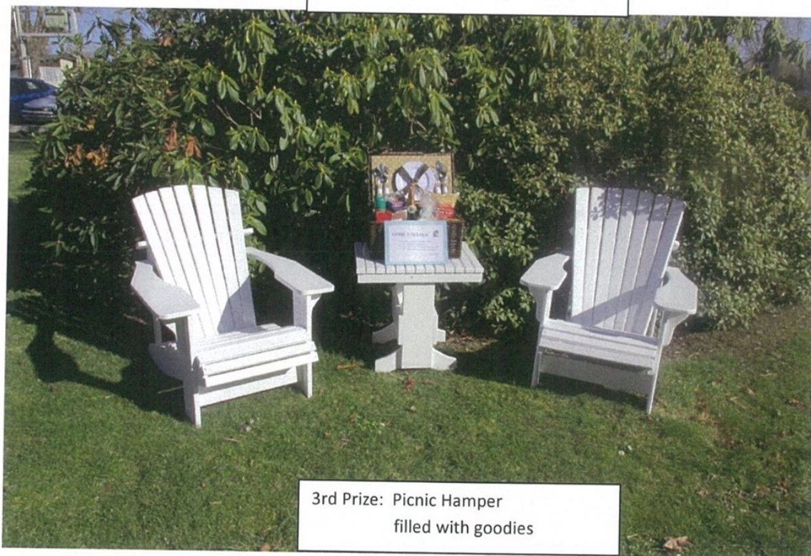
3 rd Prize: Picnic Hamper filled with goodies

Help Opihi College fundraise to purchase a defibrillator.