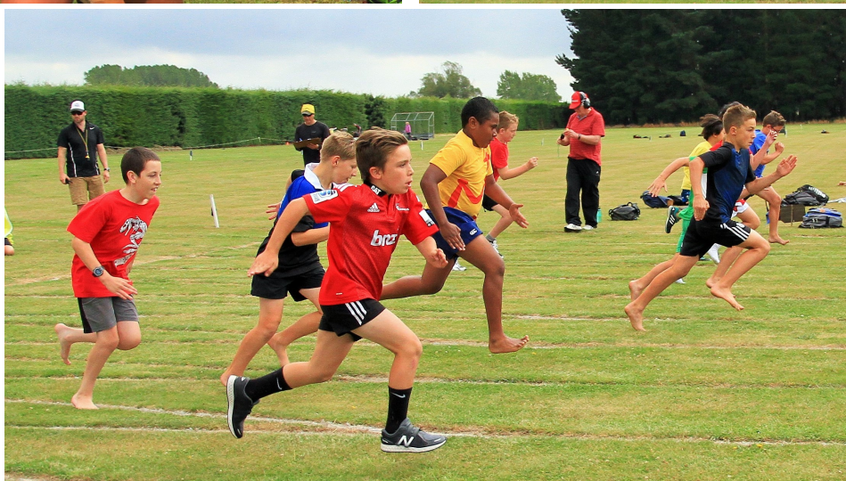
OPIHI COLLEGE ATHLETICS 2017