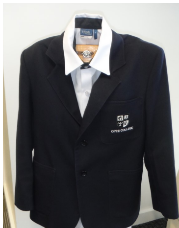
EX-RENTAL BLAZERS $100