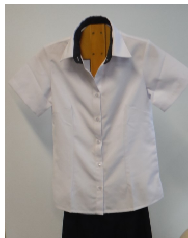
NEW WHITE SHIRTS $40

We are now supplying white shirts and blouses for senior students. These are an optional alternative to the Warehouse white shirt. These are made of a lovely thick white fabric with a navy trim on the collar band, and available for $40 each.