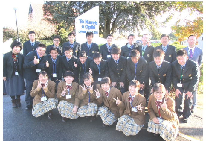
Students from the 2017 Shigakukan High School visit. Why not get involved!