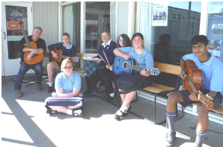
Opihi College students enjoying their music lessons this week