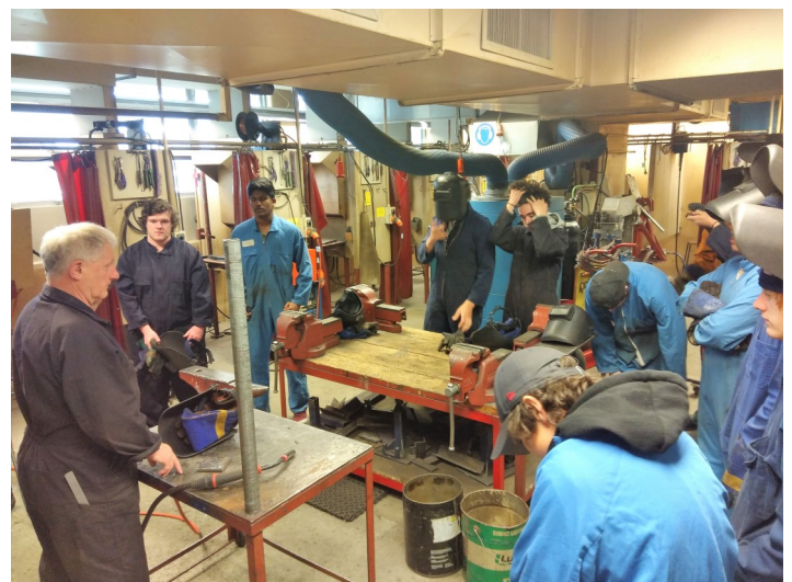
Opihi College students at an ARA welding course recently