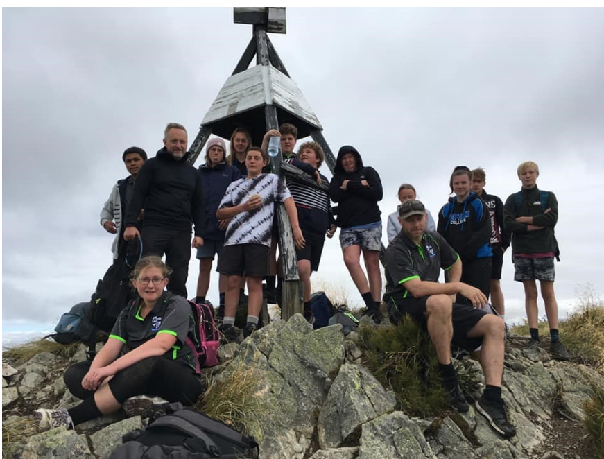
The Opihi College Te Ara Tiki team recently climbed Little Mt Peel.