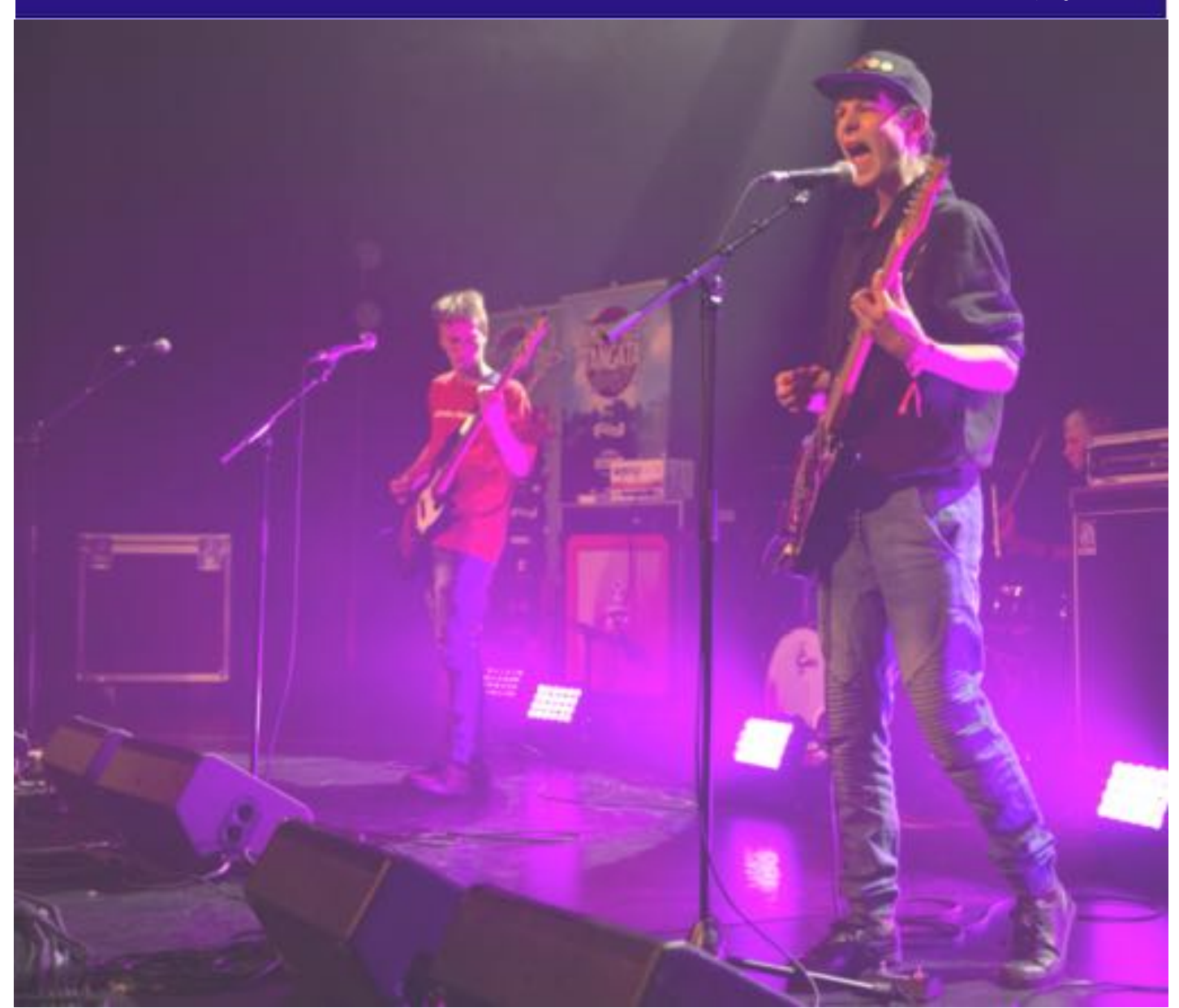
Issue 11 4th July 2019