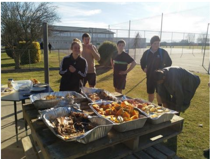
Another awesome experience last week when one of our Te Ara Tika groups laid the best hangi. Their goal was to "work together as a team towards a common goal". They nailed it and ate some yummy food in the process.