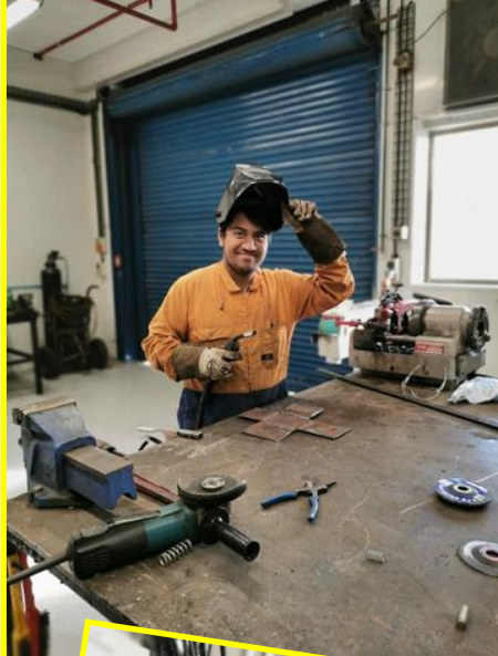
A Big "Thank You" to all the local employers who host our students for work experience on the Gateway Programme. As you can see, the students are getting to try a wide range of local employment opportunities!