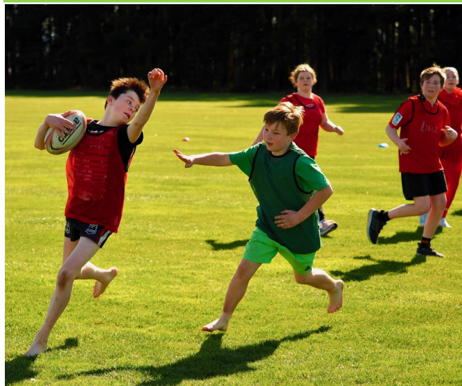
Opihi College students enjoying House Activity Day