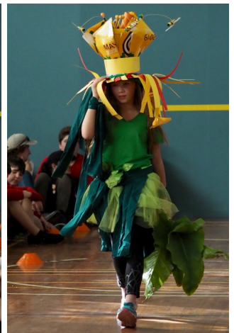
Some of the wonderful costumes our students created for the Wearable Arts competition on House Activity Day.