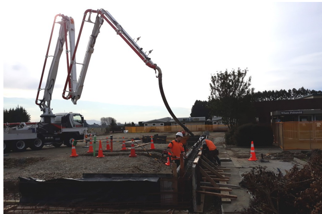
The construction teams have been back on site since the start of Level 3, and work has resumed for our new build.