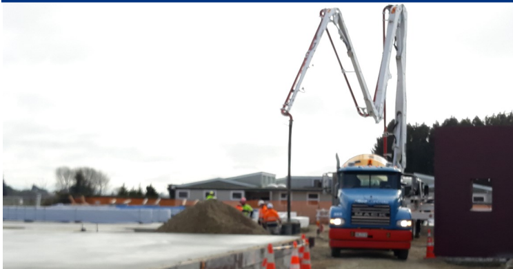
So exciting to watch the progress on site every day for our new building ...