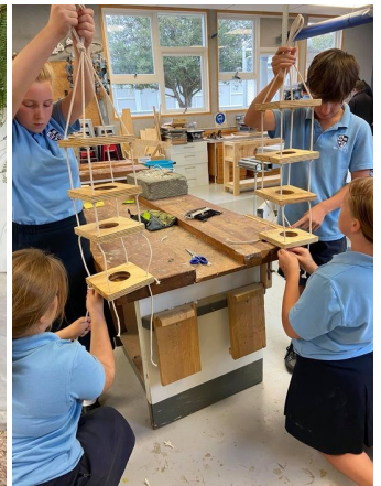
Some of our junior Technology student's wonderful work