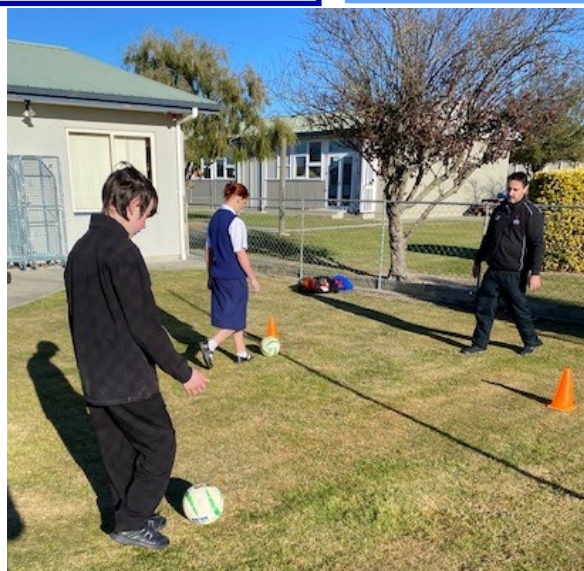
Our Kowhai House students enjoying practicing for the Special Olympics