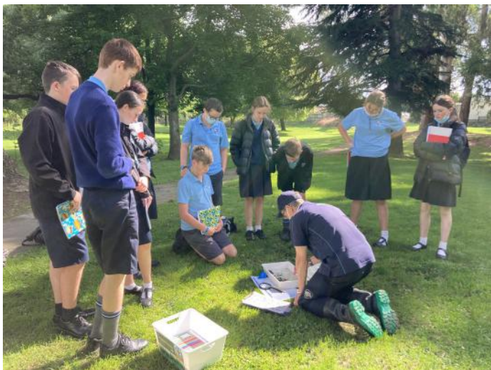
Our Year 9 & 10 Citizenship Science class visited the Taumatakahu stream recently to look at biodiversity and overall quality and health of our local freshwater environment.