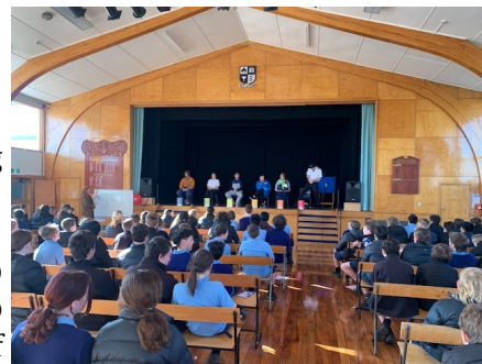
Year 7 - 10 experiencing 'Inspiring the Future'