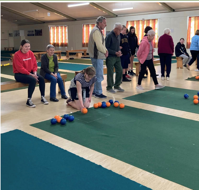
Our Year 10 Health Class enjoyed a visit to the Timaru Indoor Bowls Association to learn how to play indoor bowls recently.