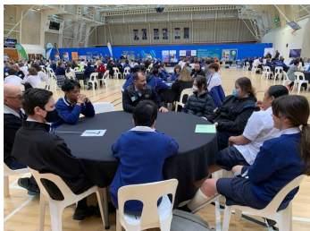
Year 11 at the South Canterbury Expo

and course applications. Course delegates from Ara, Otago and Canterbury have come to Opihi to assist our students with their course selections. We are extremely proud of a number of our Year 12 students who have been successful in gaining apprenticeships or full time employment.