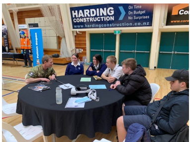
Year 11 at the South Canterbury Expo