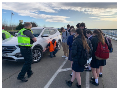
Year 12 students at RYDA Course