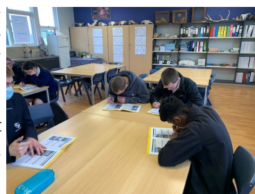
Senior Students participating in the Defensive Driving Course