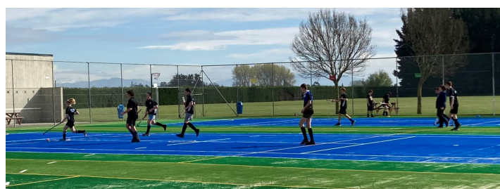
Our Year 9/10 Turf Wars class enjoying our turf in the sun