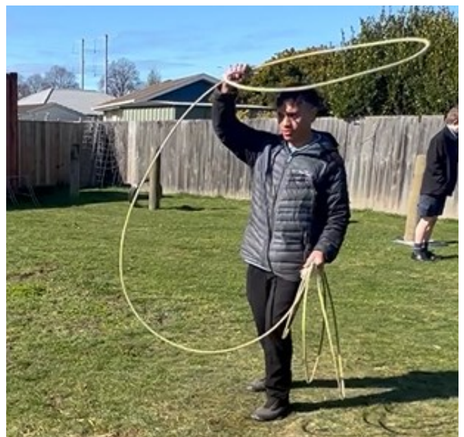
Our Agriculture class mastering a lasso in class recently

Opihi College is now accepting enrolments for 2023. Enrolment packs are available from our school office. It would be appreciated to receive completed enrolment forms for students wishing to attend Opihi College in 2023 at the school office as soon as possible.