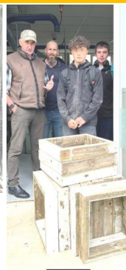
Opihi College students have been busy helping to make new planter boxes and paint the fence in the new Agricultural outdoor area this week. Good job!